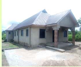
COC Kajola, Along Ajebo Road