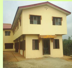
COC Mile Six Ajebo Road, Abeokuta